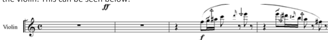
Image 2. Huowu mode on Violin music score

This is the Huowu mode which starts from F and goes to G, A #, C, D, and E, which is played on the violin. This can be seen below: