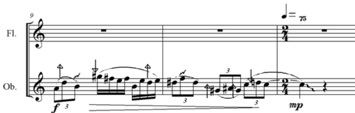
Image 3. The New Huowu mode after combined with twelve tone

The Huowu mode is then changed twelve times, following the Western music system and producing new modes. Here is the new mode found on the oboe starting on the note A as seen from bar 9 to bar 11 below: