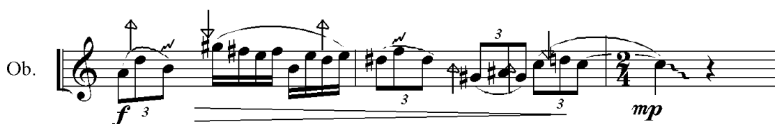
Image 6. Joget Rhythm

The rhythm of jogetis found on the oboe on bar 9 to bar 11 as below: