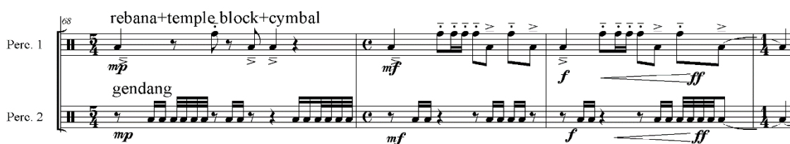
Image 7. Zapin Rhythm

The Zapin rhythm is found in the rebana , temple block and cymbal, as below: