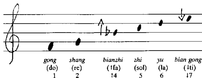
Image 1. Huowu Mode