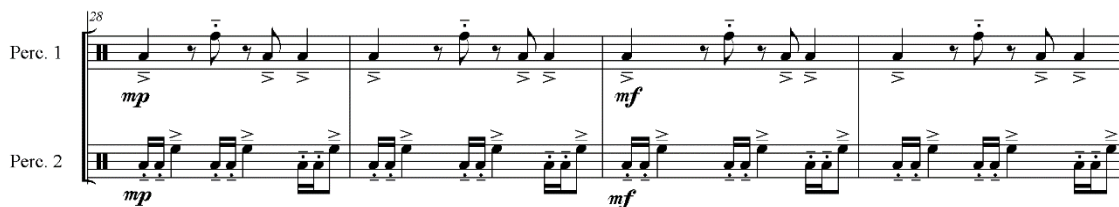
Image 5. Variation Inang rhythm on percussion

The variations of the inang rhythm played by one percussion and the two percussions can be seen from bar 28 to 31 below: