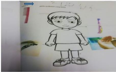
Figure 1 : unable to write name but able to match correctly

The researchers found the study useful for children under 6 years of age. It is able to educate these children to engage in the importance of their level of personal hygiene. Pedagogy Theatre allows the children to warm up and be impulsive as well as to share their own ideas. The children shared their thoughts on wanting to meet/ play with their super heroes (Ultraman, Iron man) after having brushed their teeth and the researchers found this to be of positive outcome of the study as the children have expressed a desire to be clean for someone they like. The children were able to answer were able to answer the worksheet correctly although some are not able to read or write their own name.