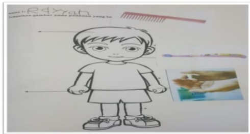
Figure 2 : attempted to write name and able to match correctly