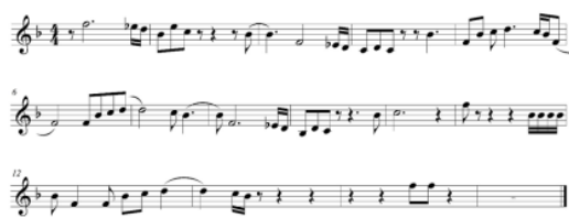
Figure 3. Example from the melodic repertoire of the pensoil

of 3/8 and the metronome mark of 80, and the third has the metric indication of 2/4 and the metronome mark of 60. From my observations during the process of recording the work, I came up with the conclusion that it is necessary to have a musical atmosphere which provides an emotional state wherein one can describe various kinds of bird songs in the morning. This reminds me of the experience of listening to the voices of birds around UPSI, as well as the area where I resided while living in Tanjong Malim. To illustrate this, I may assert that it requires “good taste,” more than mere musicianship, when keeping track with the different note values in the musical score during the process of recording, in order to describe the “communication” between the birds perching on the trees. This musical composition features different musical rhythms and other elements interlocking with each other, and the work demonstrates that interlocking can be found not only in musical compositions scored for ensembles of traditional musical instruments, but can be manifested in various different ideas, which have disclosed the identity of Song of Birds . This musical composition demonstrates many techniques used by literary writers. The incorporation of the pensoil instrumental repertoire is carried out by bringing in a chromatic scheme and generating new musical ideas. Imitations of tual bird song melodies, hill birds and the pensoil musical repertoire are sounded out