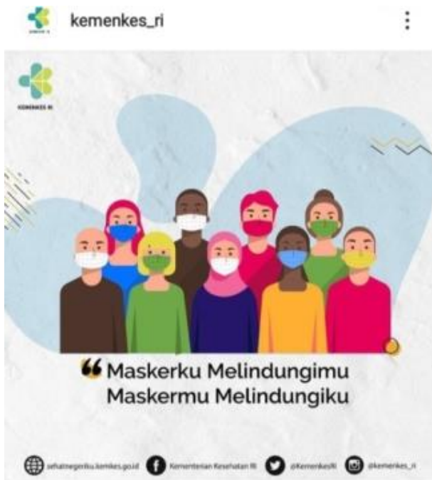
Figure 1. A Public Service Announcement on the Instagram Account of a Government Organization in Indonesia

From what can be found in the literature on PSAs, the researchers note that PSAs themselves seem to be seldom studied. Most studies use PSA as a catalyst for an effect and were more concerned in investigating those effects rather than the PSAs, usually by distributing surveys to a great number of people. For example, Crozier, Berry, & Faulkner (2018) explored parents’ attitudes towards children’s physical activities after viewing a PSA called Mr. Lonely , which highlights the negative effect of screen time on children’s outdoor playtime. The study’s examination found that the PSA’s message variables (i.e., personal relevance, novelty of information, and feelings toward sponsoring organization) showed an overall positive relationship with parents’ attitudes. Reidenberg & Berman (2020) highlighted the scarcity of studies evaluating the impact of suicide prevention PSA campaigns as most only demonstrated how it can increase awareness or knowledge. Results of the study offered initial evidence on how suicide prevention PSA campaigns influenced audience to engage in help-seeking