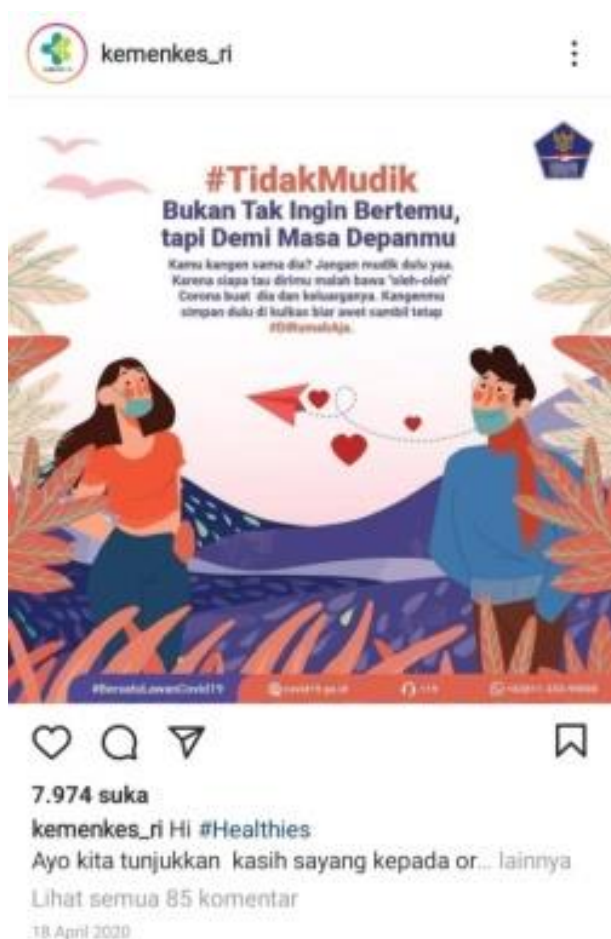
Figure 5. An example of Particularised Conversational Implicature

to have a particular background knowledge to understand the implied meaning. Only two out of eleven PSAs published from March 2020 to January 2021 were found to contain this type of implicature (18 per cent).