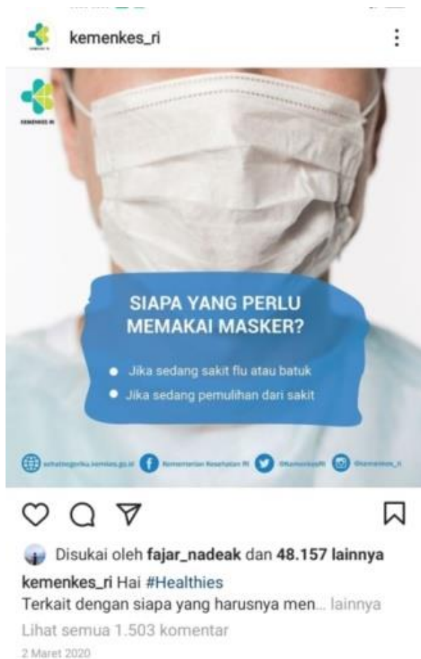
Figure 6. An example of Conventional Implicature

This public service announcement presents the question “ Siapa yang perlu memakai masker? ”, which means “Who needs to wear a mask?” Two answers are offered for this question in the bullet points below it, “ Jika sedang sakit flu atau batuk ” and “ Jika sedang pemulihan dari sakit ”, each respectively means “If you have a cold or cough” and “If you are recovering from illness”.