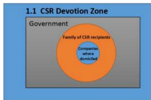
Figure 02. The Right Target of CSR Zoning